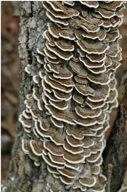
Mushrooms on trunk