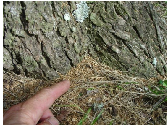
Boring dust in cedar elm