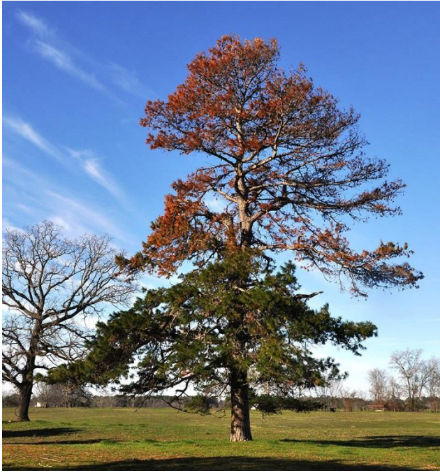
Pine attacked by engraver beetles