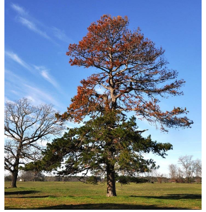
Pine attacked by engraver beetles