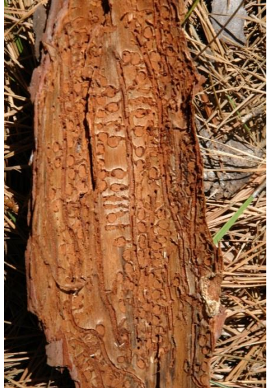
Engraver beetle galleries in loblolly pine bark