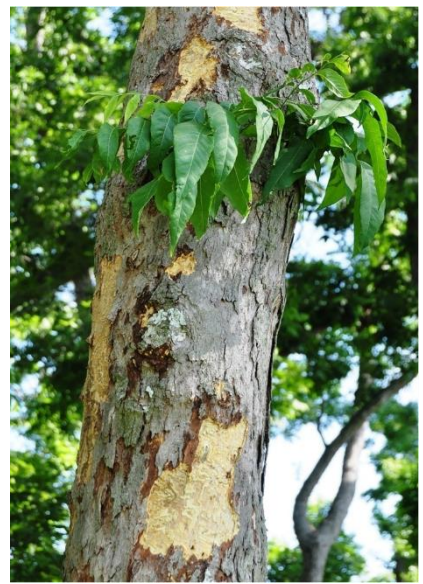
Soapberry borer infestation

Insect presence or evidence such as leaf chewing and rolling, holes in the bark, sawdust, etc.