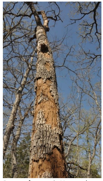
Brown fungus is Hypoxylon canker