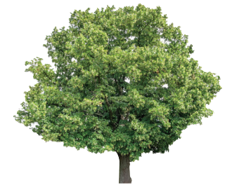
Every year, 1 large tree

National Tree Benefit Calculator http://treebenefits.com/calculator/ USDA Forest Service Center for Urban Forest Research http://www.fs.fed.us/psw/programs/uesd/uep/ Arbor Day Foundation http://arborday.org/trees/index-benefits.cfm International Society of Arboriculture Consumer Information Program http://treesaregood.org/